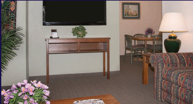
Sizable living rooms