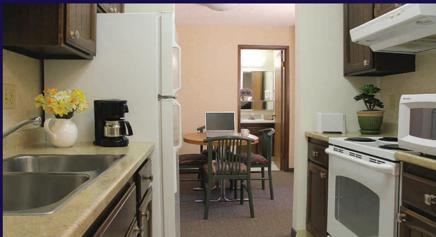
Well-appointed kitchens - cutlery to cookware