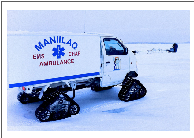
Maniilaq track vehicle, Kivalina, AK

Requests are reviewed and approved at both the local and regional levels before being scrutinized by the State's Code Blue Steering Committee. The Committee consists of representatives from each of the seven EMS regions and the State EMS Office. From this collaborative process, one prioritized list is made annually of essential EMS equipment that addresses Alaska's most critical needs. During the past twenty-one years, a $7.7 million investment from the State of Alaska served as the catalyst for additional grant monies, yielding more than $27 million in capital projects.