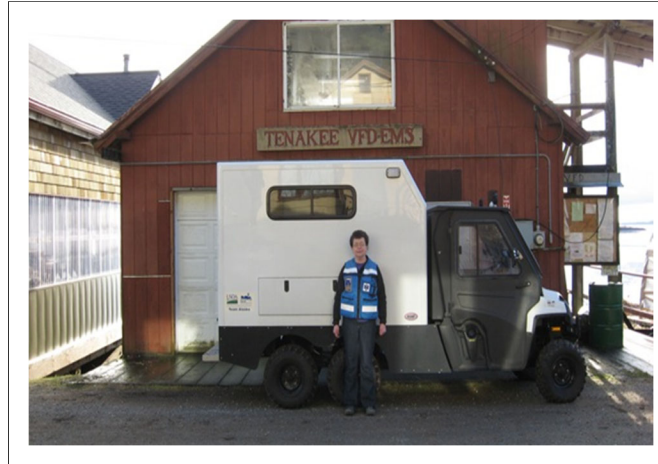
Patient transport for the boardwalk community of Tenakee, AK

In the late 1990's, Alaska's rural EMS community was declared to be in crisis due to aging infrastructure. The Code Blue Project was established to provide essential EMS equipment by leveraging limited state dollars with funding from other non-traditional sources. This influx of resources has helped to provide patient care and training equipment, patient transport, and communication needs, allowing responders to do their jobs in a safe and effective manner.