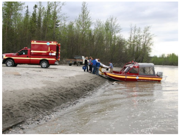
Patient Transport Vehicles—Whitestone Farms Community—Delta Community only accessible by boat in the summer

The variety of projects reflects the vast geographical and environmental differences in Alaska. Ambulances, snow machines and ATVs with patient transport sleds and carts, boats equipped with first responder gear and other unique patient transport vehicles are funded along with cardiac monitors, radios, oxygen delivery systems, pediatric and training equipment.