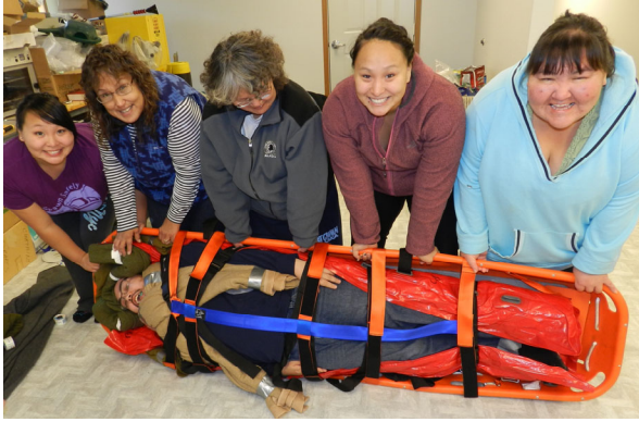
Chugachmiut Health Aides in EMT training with Tatitlek's Code Blue vacuum splint at Port Graham Training Center.